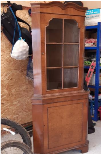
One Corner Unit – Offers accepted

Phillippa Howe has all these items for sale.