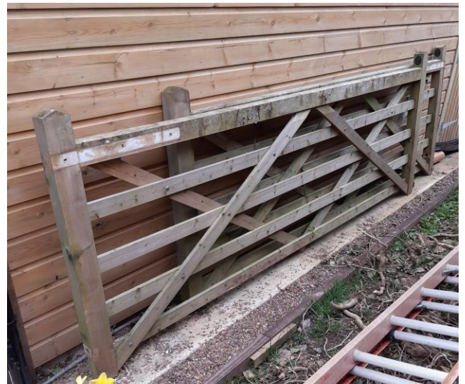
Two 10 foot gates – offers accepted